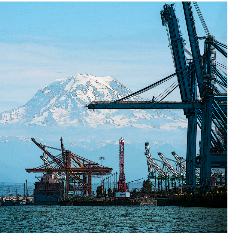
South Harbor • Blair Waterway, Tacoma